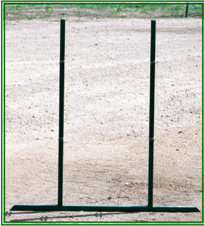
Alley Support Short 40" T x 18" W $65.00 wt. 10 lb. Also available but not shown 78" T x 18" bow style $95.00