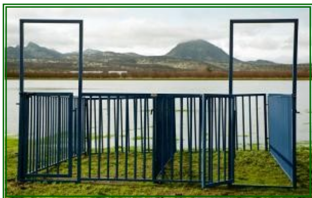
10' No Climb with 2 gates. Attached to a 10' No Climb panel.

Bow gate option is $30.00 extra per gate. Custom color setup fee $75.00