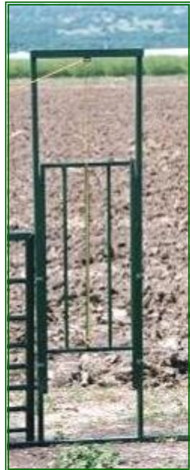
Drop Gate ~ 6' tall $195.00 - wt. 40 lb.