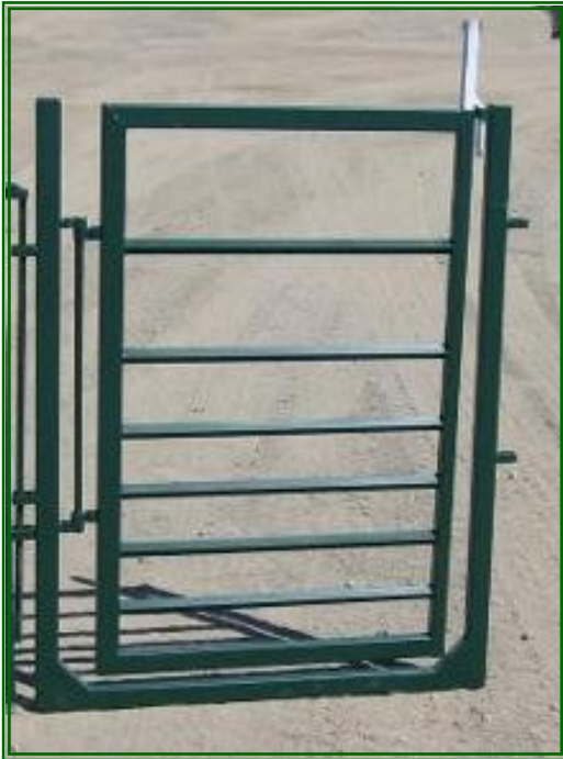
36" Walk Thru Gate Overall 42" - Gate 36". $155.00