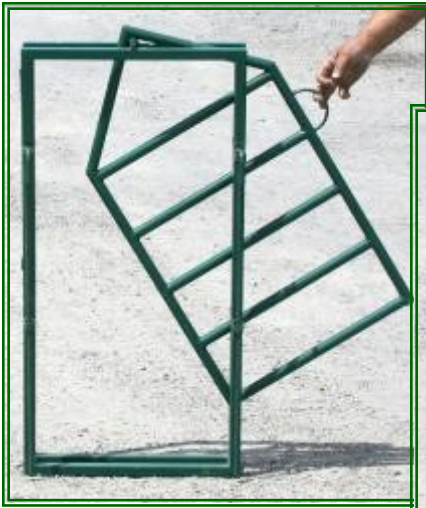
Pendulum Gate $165.00 - wt. 35 lb.