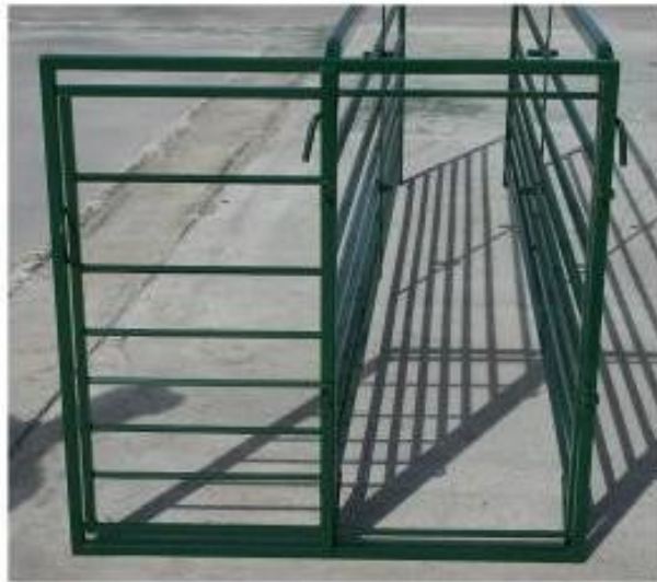
Alley Slide Gate $165.00 wt. 50 lb.