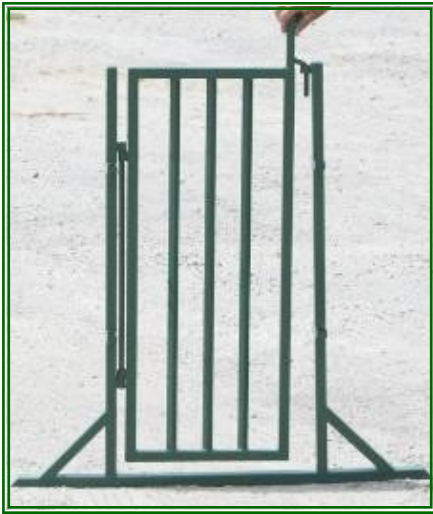
Alley Swing Gate 40"T x 20" W. $135.00