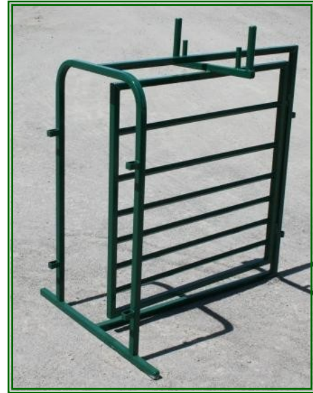
2-Way Sort Gate $205.00 - wt. 50