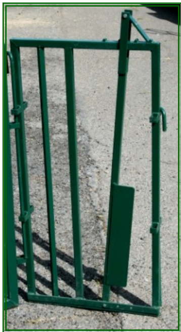
Manual Head Gate $180.00 - wt. 30 lb