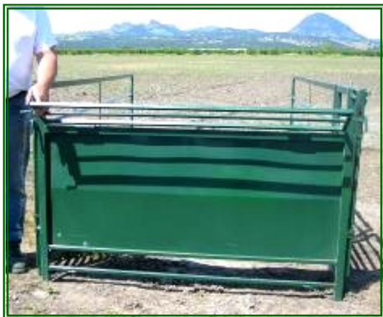
5' Solid Panel with 8" Drop $150.00 - wt. 40 lb.